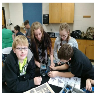
The 4-H After-School Robotics Club in Iosco County received a $1,000 Michigan 4-H Legacy Grant to use VEX Robotics as a tool

Learn more or apply online at http://mi4hfdtn.org/grants . Questions? Contact the Michigan 4-H Foundation at 517-353-6692.